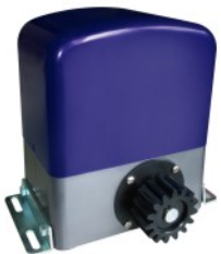
* Blue / Yellow Cover

Driving gear: Rack and pinion Operating voltage: DC12V-30V Max. Output power: 160W Max. Linear speed: 0.28m/sec. Max. Weight of gate: 600kg Max. Length of gate: 10m Main supply: AC110 / 220V, 60Hz / 50Hz